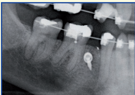
An X-ray showing a mini-screw placed between the lower teeth